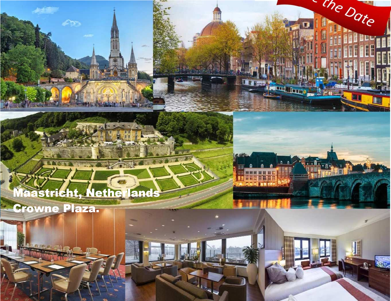
Maastricht, Netherlands Crowne Plaza.